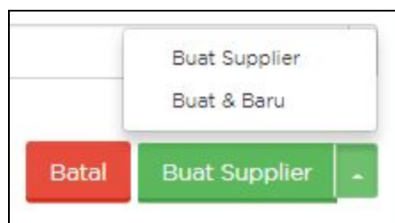
Figure 3.. Cancel and Create Supplier Button

In the picture 2. complete the name of the supplier and the description of each column of fields marked (*) then it is a required field to be filled as shown in Figure 2. which indicates the required fields are Name of Calls, Accounts Receivable and accounts payable and if indeed needed more information then contents of other information.